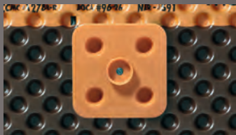
DELTA®-FAST'ner multistud fastener for secure attachment of DELTA®-MS.

Dörken makes your life easier – systematically.