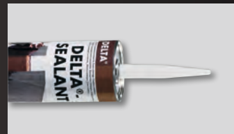
DELTA®-SEALANT elastic sealing compound used at overlaps and penetrations.

DELTA® is a registered trademark of Ewald Dörken AG, Herdecke, Germany.